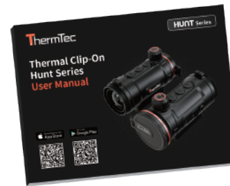
User manual (x1)