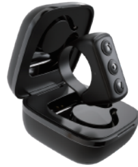
Remote control (x1)